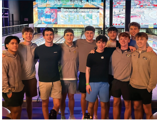
Brothers attend our service event with Big Brothers Big Sisters.