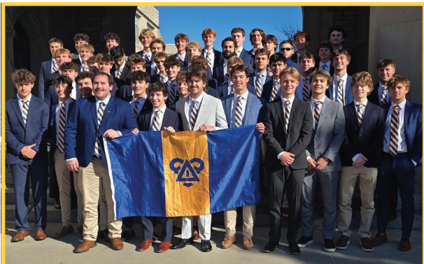
Brothers gather for fall initiation at Memorial Union.