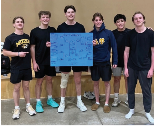
DU's volleyball team celebrates their RAMS competition victory.